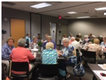
Bridge players enjoy year end brunch